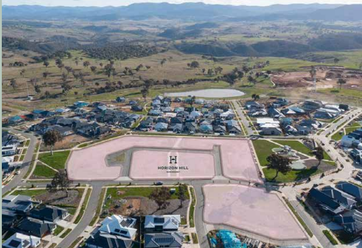
An aerial shot of Horizon Hill overlooking the Brindabellas

It's about waking in the morning, taking in the views and breathing the fresh air. It's about joining an established and thriving community you'll look forward to coming home to and welcome being a part of. It's your home in paradise.