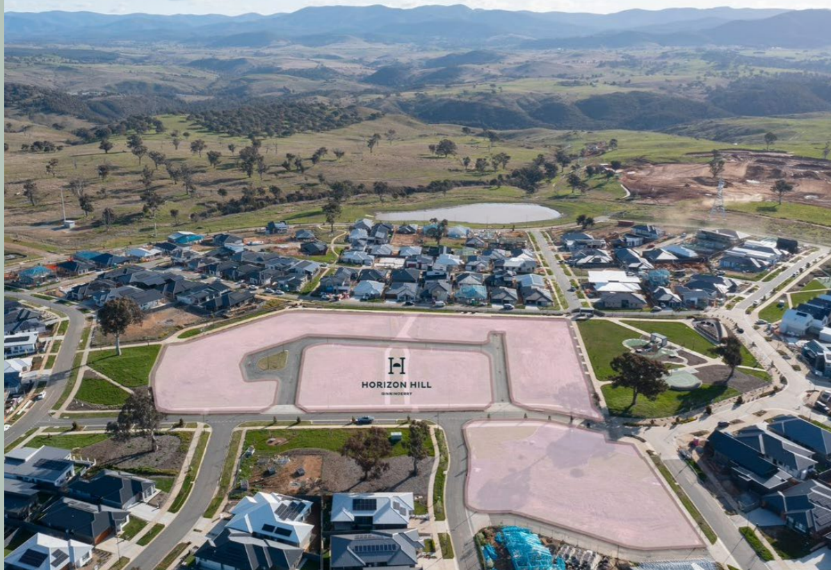
An aerial shot of Horizon Hill overlooking the Brindabellas

It's about waking in the morning, taking in the views and breathing the fresh air. It's about joining an established and thriving community you'll look forward to coming home to and welcome being a part of. It's your home in paradise.